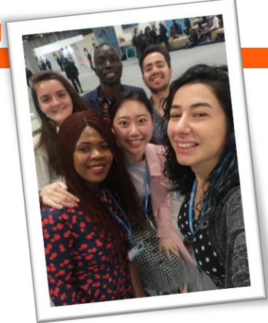
Meeting with the IFSA delegates in the morning to debrief each other's impressions so far