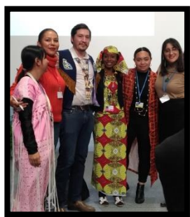
-International Indian Treaty Council December 13, 2019 @ 13:30

On the COP25 app's Webcast, you'll be able to view all the different conferences that were organized by indigenous people.